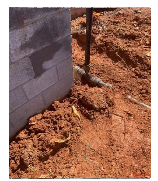
Continuing underground plumbing