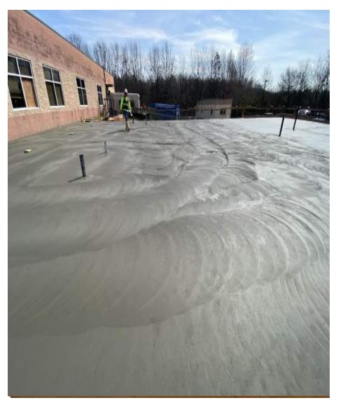
Poured concrete slab